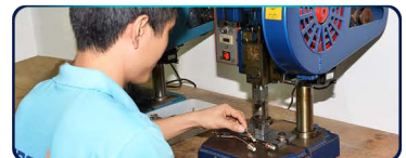
4 puncher machine