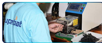
2 wire stripping machine