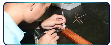
3 manual electric welding machine