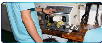
1 wire cutting machine