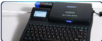
6 label making machine