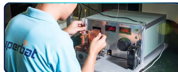
5 clamp welding machine